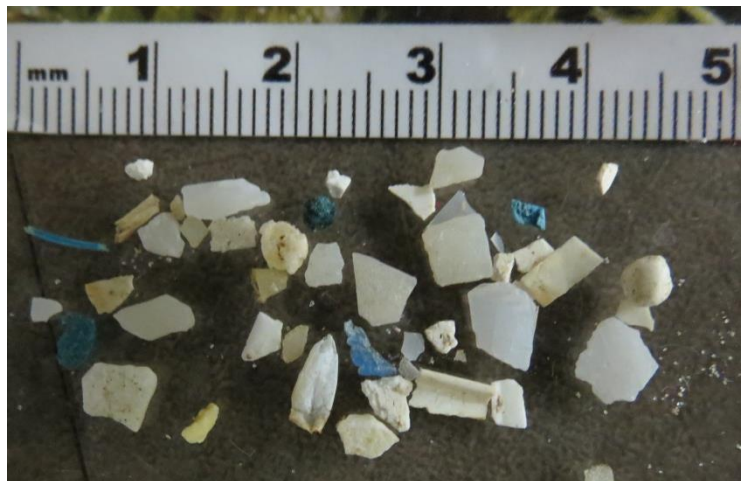
Sediment/wrack samples soaking (left); microplastics found in beach sand (right): Photo credits: Maia McGuire